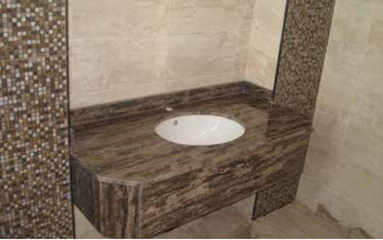
PRIVATE VILLA - COUNTER