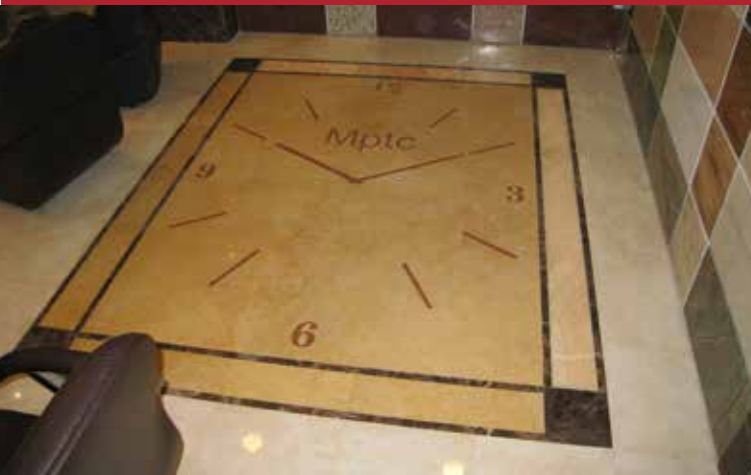
AL MAJLIS PLASTER & TILES OFFICE SHARJAH