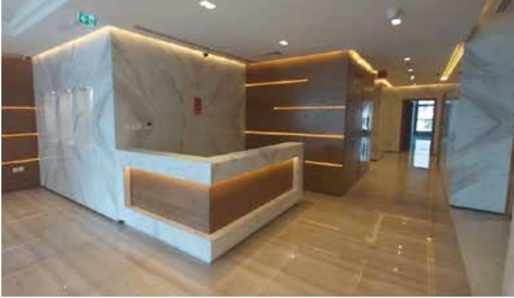
JADDAF WATERFRONT BUILDING 2020 -DUBAI