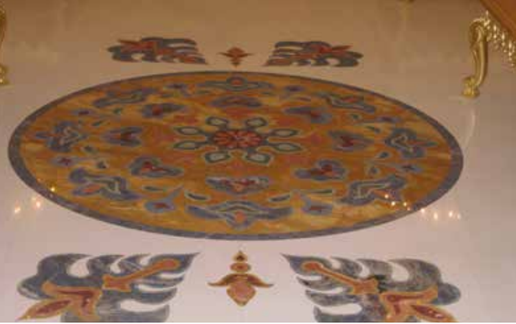
KING OF BAHRAIN PALACE ABU DHABI