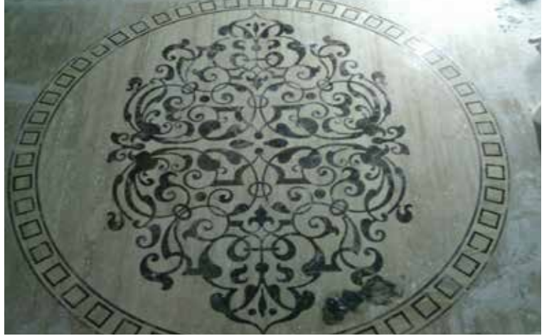
SHERATON HOTEL - SPA SHARJAH