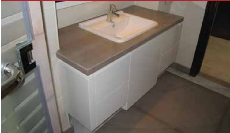
COUNTERS- PRIVATE VILLAS