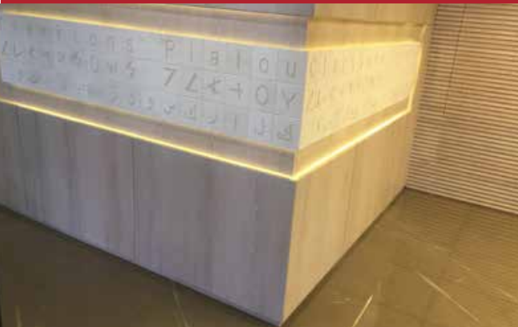
CLARKSONS COMPANY MAIN OFFICE DUBAI- J L T -2017