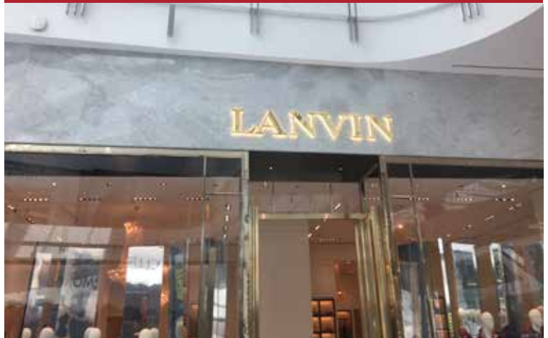
DUBAI MALL- LANVIN 2018