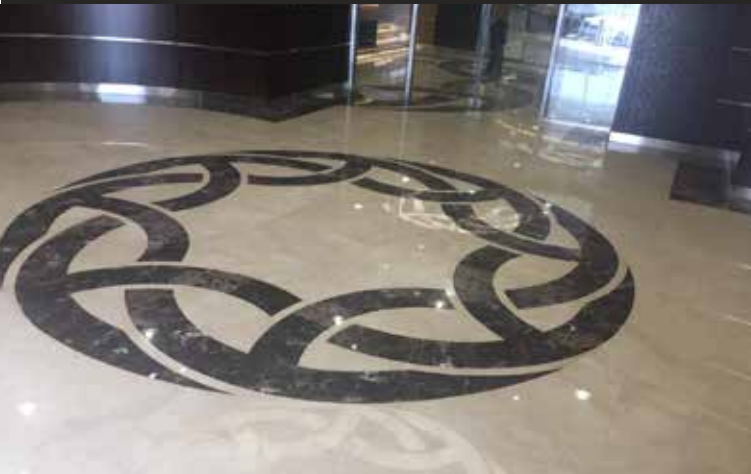
AL MASRAF BANK - DUBAI TIMES SQUARE