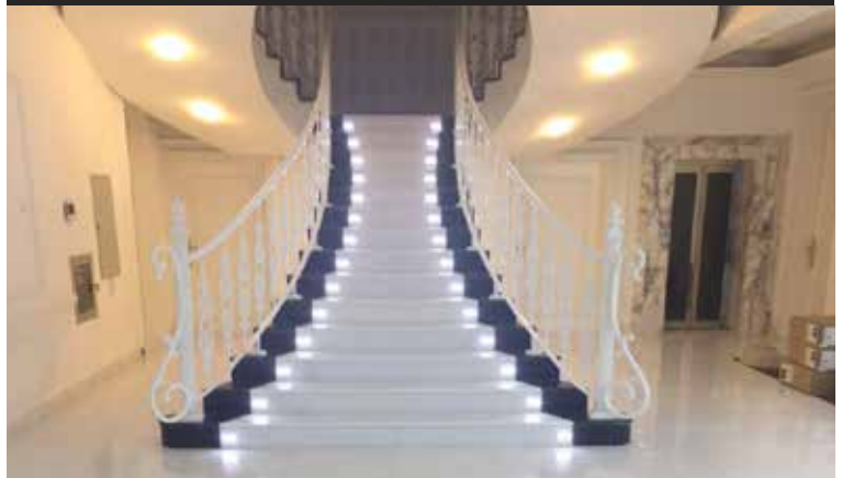
PRIVATE VILLA JUMEIRAH