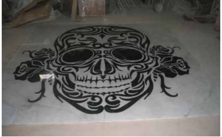
VIA RODEO DRIVE HOTEL ABU DHABI